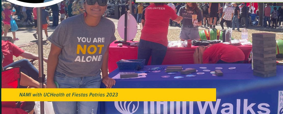
NAMI with UCHealth at Fiestas Patrias 2023